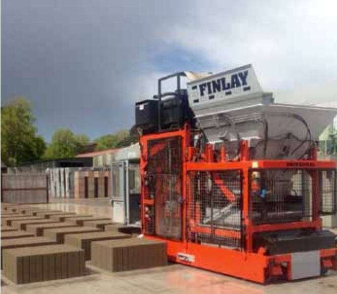
F44 refurbishment, on-site in Portadown.