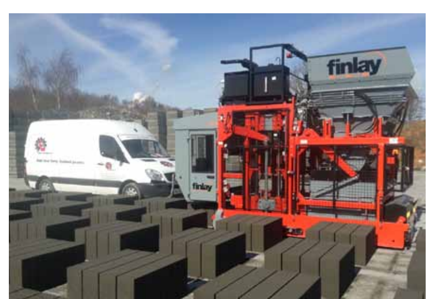
F44 commissioning, Yorkshire.