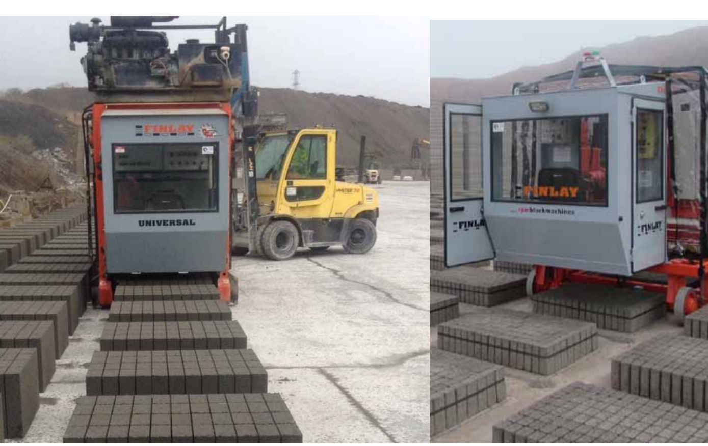
F44 block-maker on-site in Lisburn, serviced and supplied by ourselves – RPM